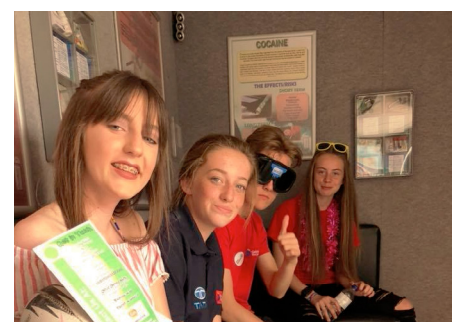
Drug Bus Session