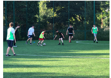
Football session run every Monday