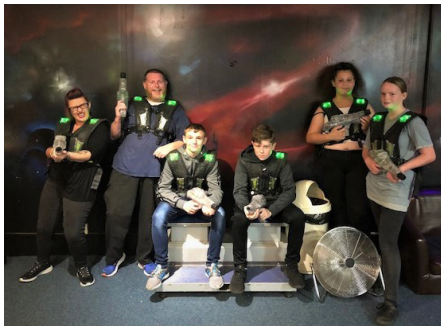
Summer Project: LazerZone