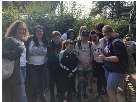
Summer Project: Oakwood park