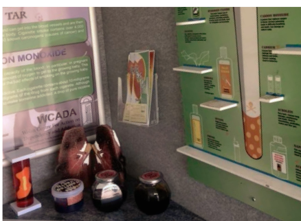
Drugs Bus Displays

The bus can be hired (for free) to attend community events or for more structured session within schools. The structured sessions last 30 Minutes and the bus can take 15 people per session. If you wish to book Contact us on 01639 630630 or e-mail brettjames@wcada.org