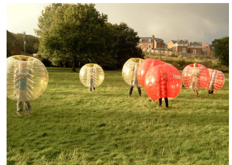
Domino: Zorb football event